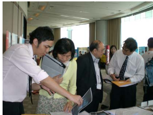
Let's Discuss on the benefit and the use of the PBK-2C